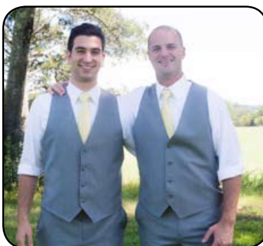
BEST MAN & GROOM