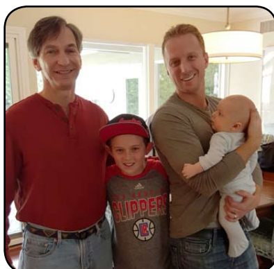
THE CAMP L.A. SCENE