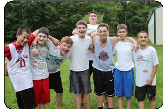
THINK THEY GET WHAT CAMP IS ABOUT?