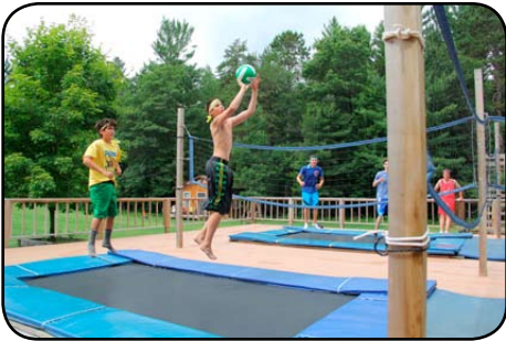
BOUNCING AND HAPPY