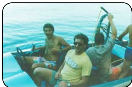
SOME OLD GUYS IN A BOAT