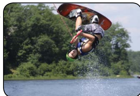
NO BIG DEAL, REALLY...