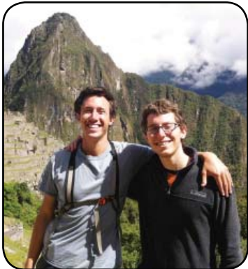
BREEN BOYS IN MACHU PICCHU