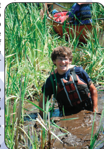
THE JOYS OF QUETICO!

One last little bit of cool camp news. Our website has become a pretty important hub for camp families and staff members. Over the last few years, we've actually enrolled a few campers via our site too! Imagine that...no camp visit, no word-of-mouth referral...just liked the website and signed up for camp! We needed an update on the section of our site that allows you to take a "virtual tour" around camp, and we