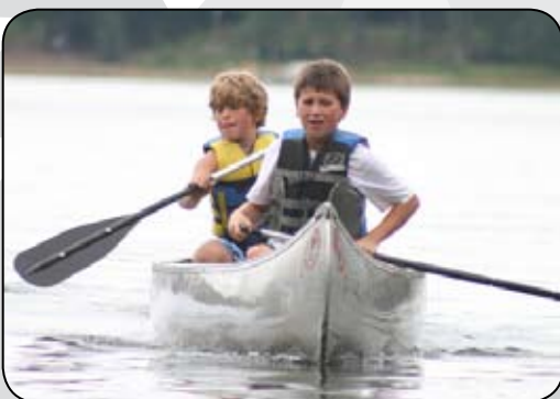
Paddling on the Flambeau River

As if that wasn't enough, we've got another major project underway. The Manor, the log cabin in the middle of camp, has undergone multiple changes and reincarnations over the decades. It currently houses camp office space and the Infirmary. It has been upgraded multiple times, and really has become a beautiful and very functional building. Well, we're adding on to it as we speak. Since camp ended last summer, our builder has been adding about 500 square feet to the north end of the building, towards the Arts & Crafts Shop. That additional space will be integrated into the Infirmary, providing 5 additional isolation rooms and an additional nurse's room. All of the floors in the Infirmary will be ceramic tile, making it much easier to keep clean. While we're at it, we're replacing the roof, restoring the original logs on the exterior, and adding some cultured stone surfaces to the exterior as well. When it is finished, it will be even more functional, and it will be even more beautiful. Camp is in fantastic shape, and we