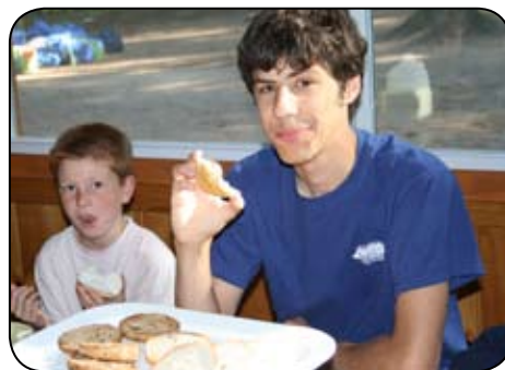
Bagels? Must be Cruiser Day!