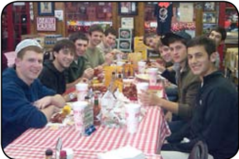
Houston Boys at the Ragin' Cajun