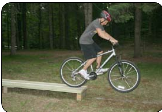
Airborn on a Mountain Bike!