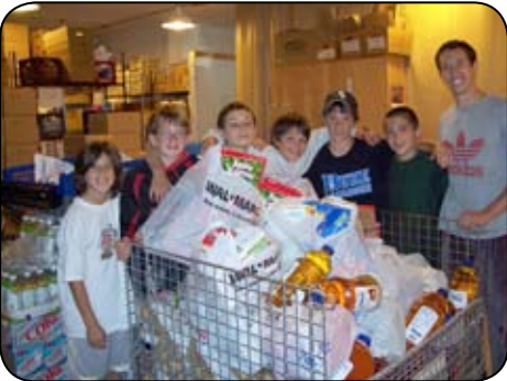
Timberlane Campers Make a Huge Donation to the Local Food Bank