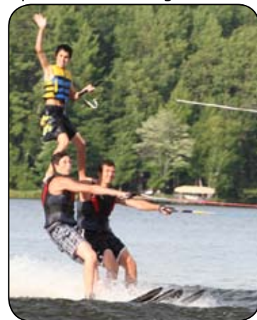
Timberbats Continue to Wow Audiences